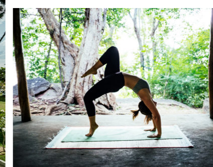
CLOCKWISE FROM TOP LEFT: Refreshments at Chaarya Resort & Spa, served both indoors and at the pool; yoga session at Amaya Lake; the swimming pool at Turyaa Kalutara

of the hotel. For those who want to explore, it's close to the city's buzzing Fort area, with its boutique shops and landmarks such as the Old Lighthouse. There's also good road access to Galle, home of Asia's largest surviving European-built fortress, and Ella, near the photo-worthy Nine Arch Bridge viaduct. Rooms: From £97 per night, room-only.