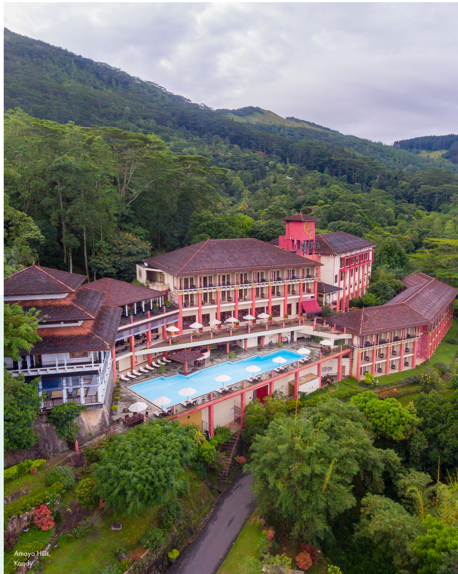
Amaya Hills, Kandy