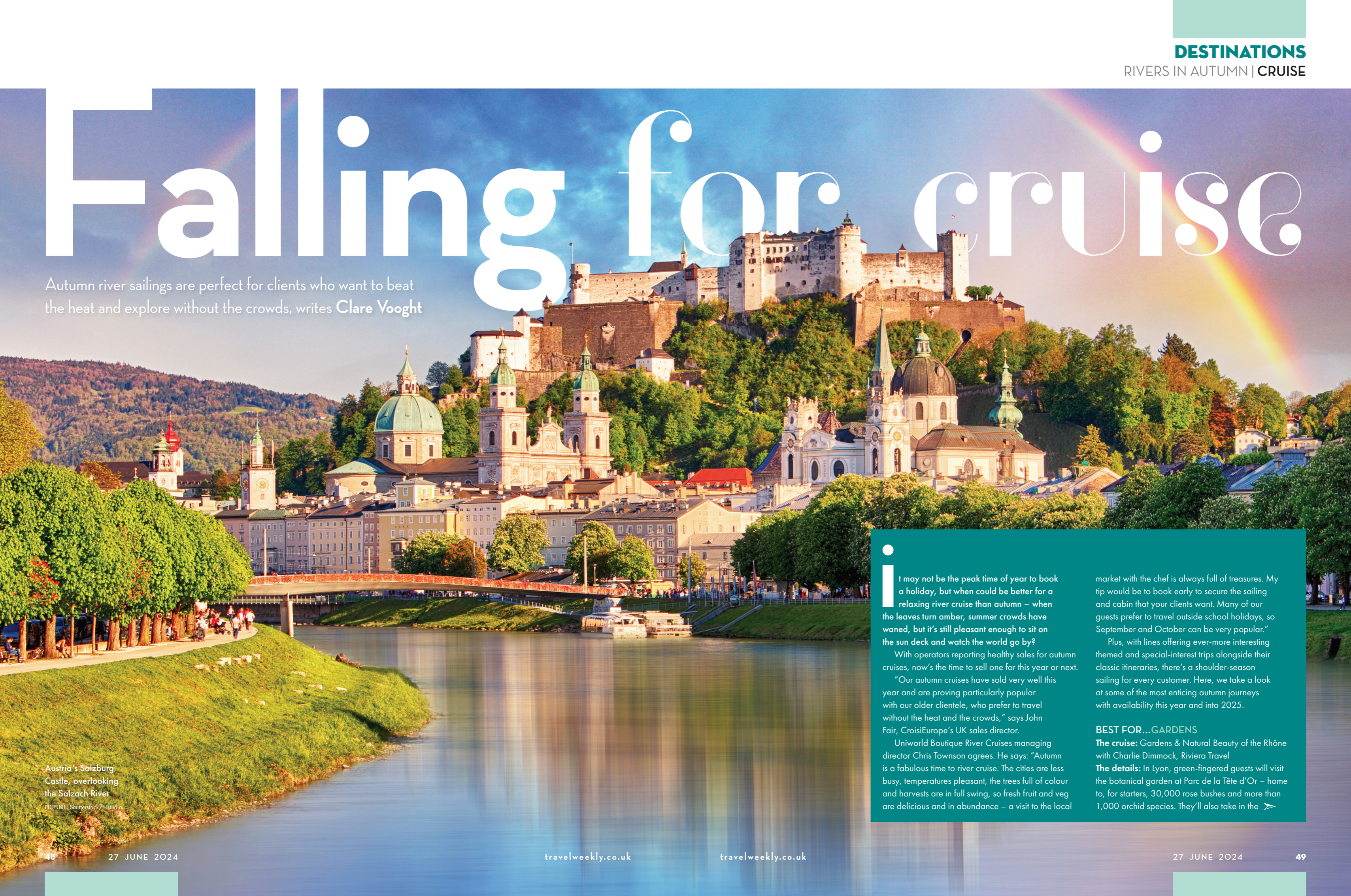
Austria's Salzburg Castle, overlooking the Salzach River

Autumn river sailings are perfect for clients who want to beat the heat and explore without the crowds, writes Clare Vooght