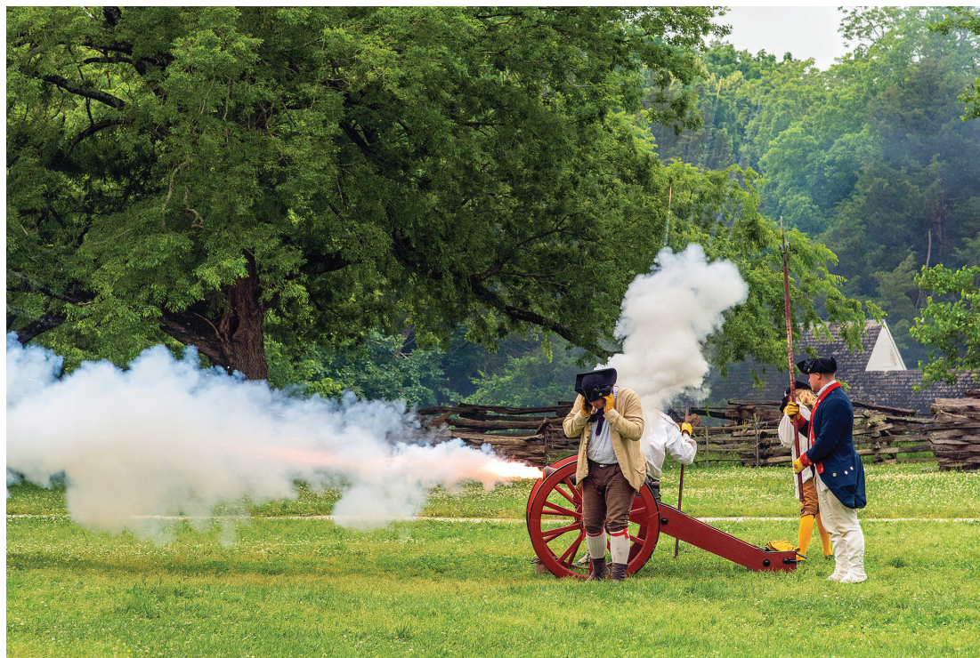
ABOVE: Historic Williamsburg features on an American Cruise Lines sailing

Book it: An 11-day sailing costs from £5,995, departing on October 14, including flights, all meals and tips. fredholidays.co.uk