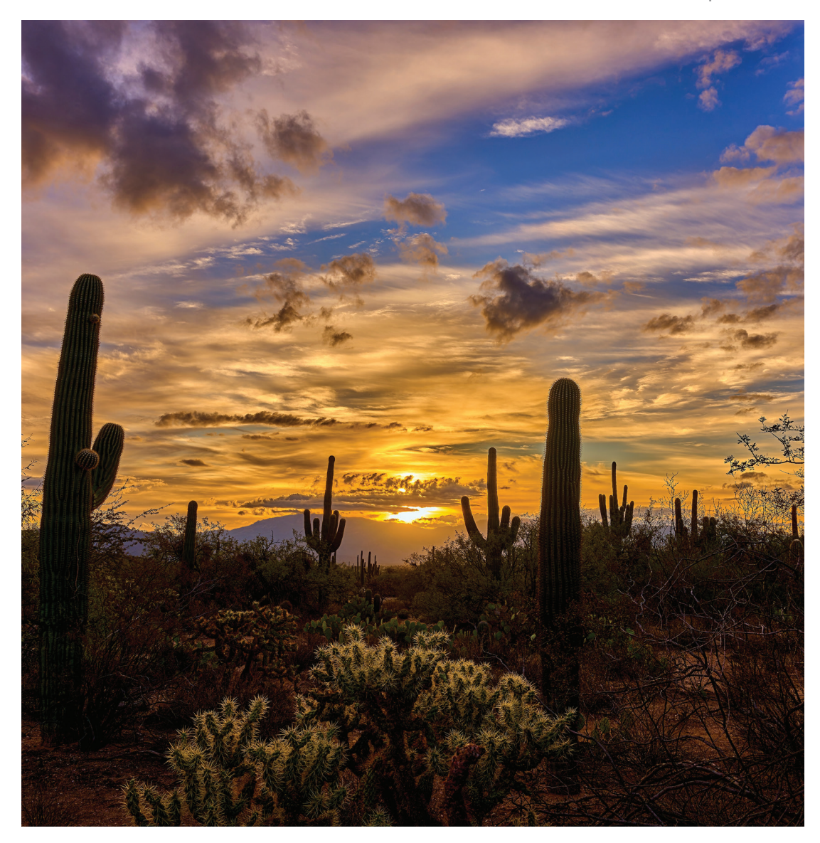
ABOVE: Saguaro cacti in Sabino Canyon

horseback. It's one of several memorable adventures I have during my stay here; one morning, I head out on a kayak, gliding down the Salt River as wild horses graze on grassy banks and giant tangerine-orange rocks soar into the sky. In the evening, I venture off on a hiking trail, watching as the landscape turns deep ruby at sunset. It feels as if I've stepped into a John Wayne movie.